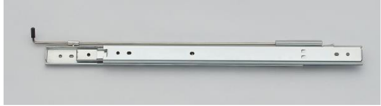
Above example is a right sided slide